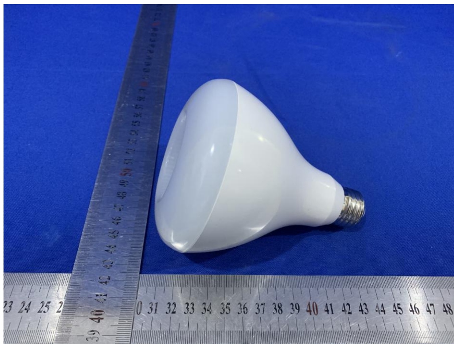
View of Product-3