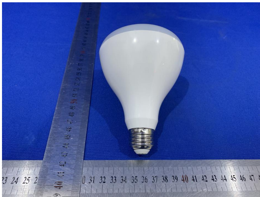
View of Product-4