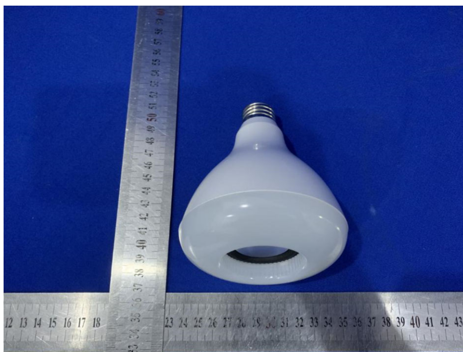
View of Product-1