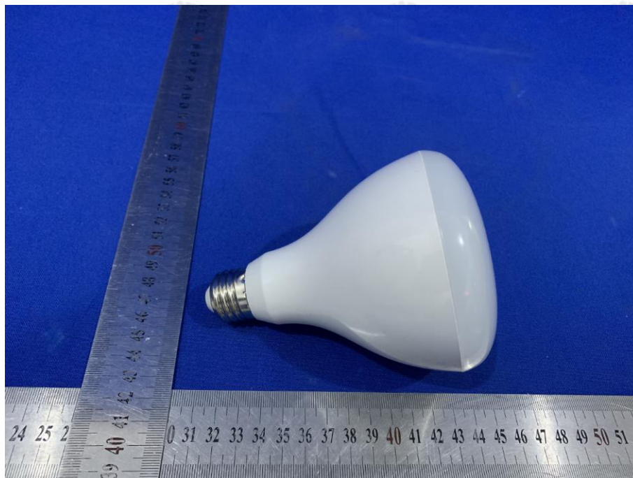
View of Product-5