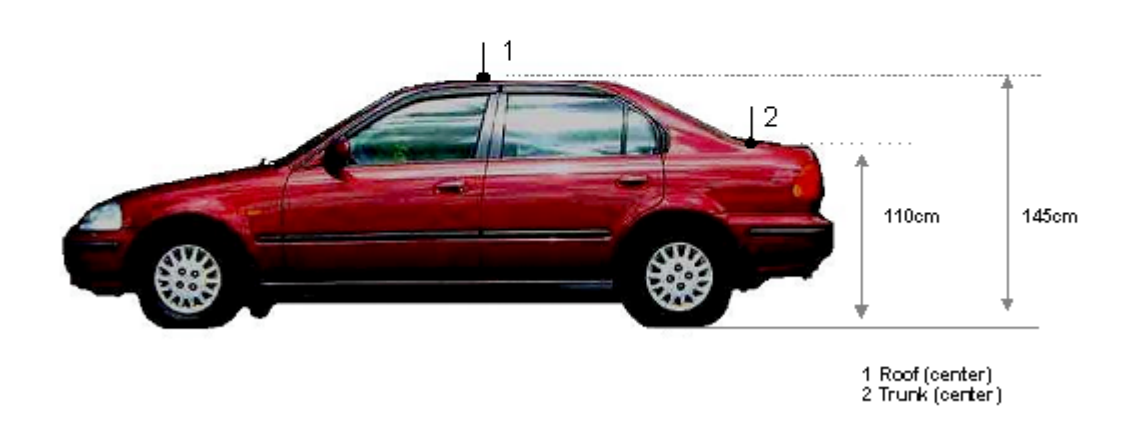
External Test Positions O