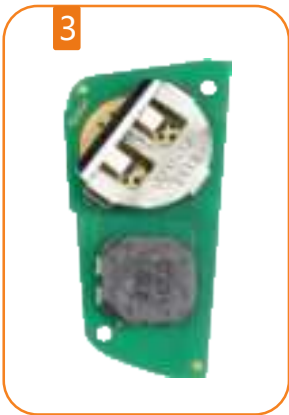
Take the battery out and replace new one

Note: The battery type is 2032 with 3V, ensure the positive and negative of battery is correct.