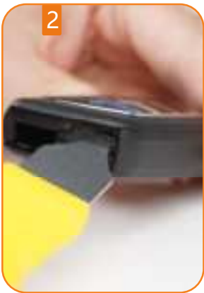
Use the tool into the gap to separate the shell