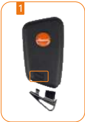
Press the back side button for loose the mechanical key holder

First use or when the battery runs out need to change new battery, following steps: