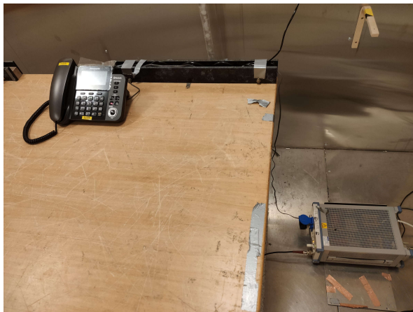
Power-Line Conducted Emissions