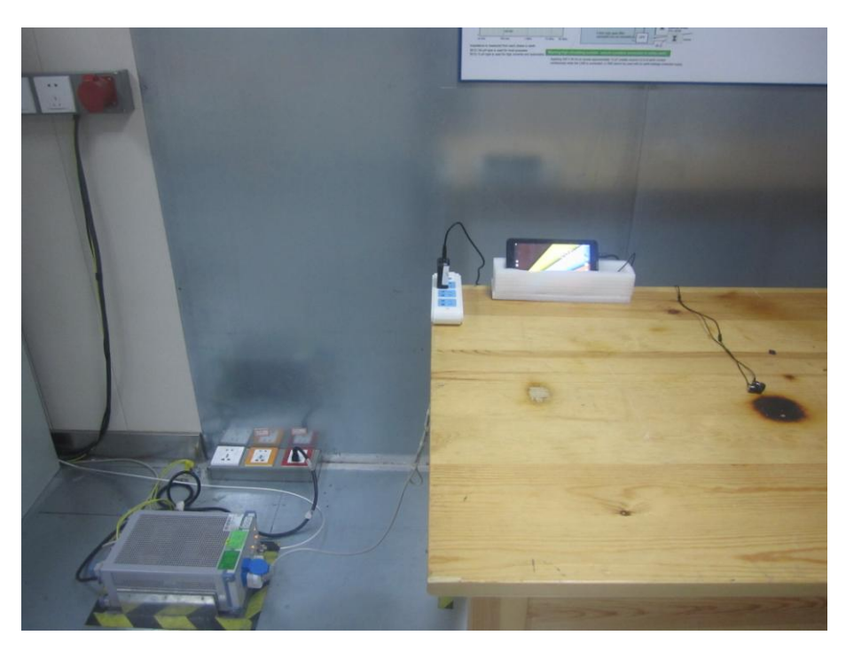
DTS radiation L