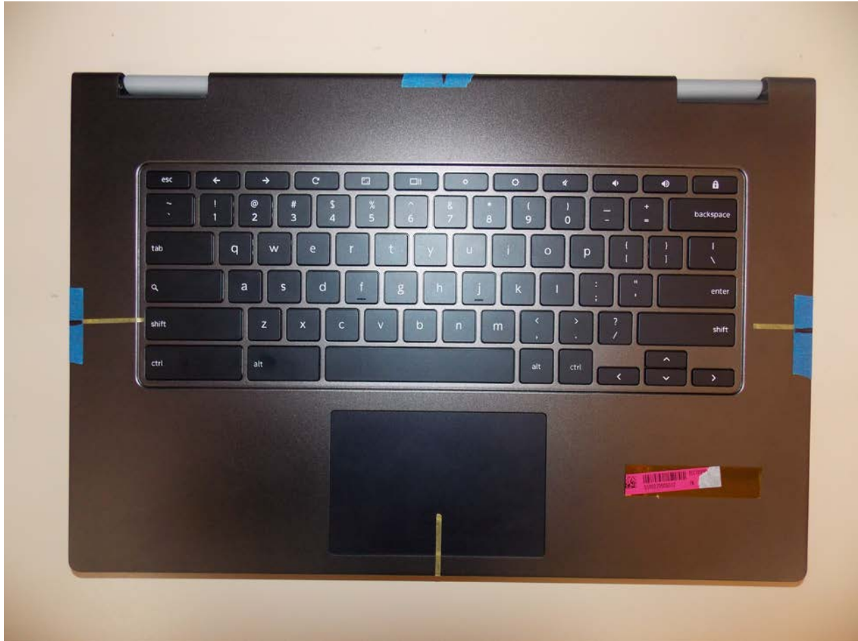
Back of Device Tablet Mode