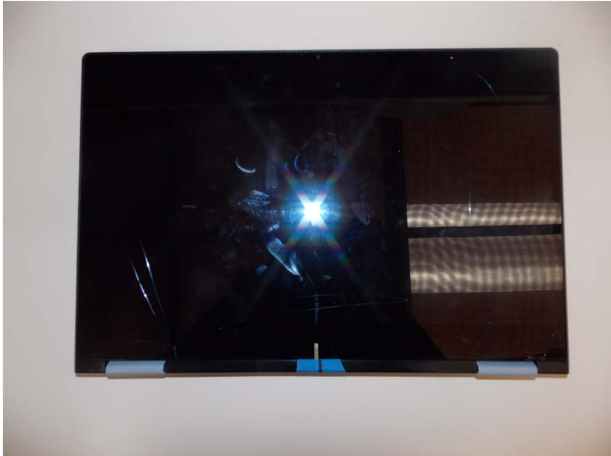
Front of Device Tablet Mode