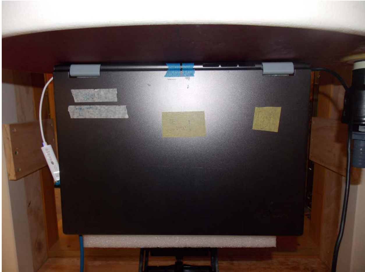
Test Position Laptop 0 mm Gap

Note: Power cable and USB adapter are removed prior to testing.