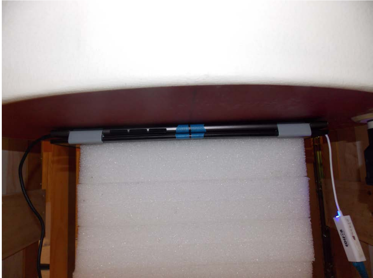
Test Position Back 0 mm Gap

Note: Power cable and USB adapter are removed prior to testing.