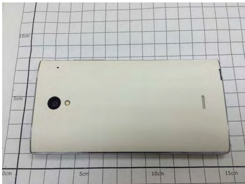
Fig. 5 Back view of EUT (White)