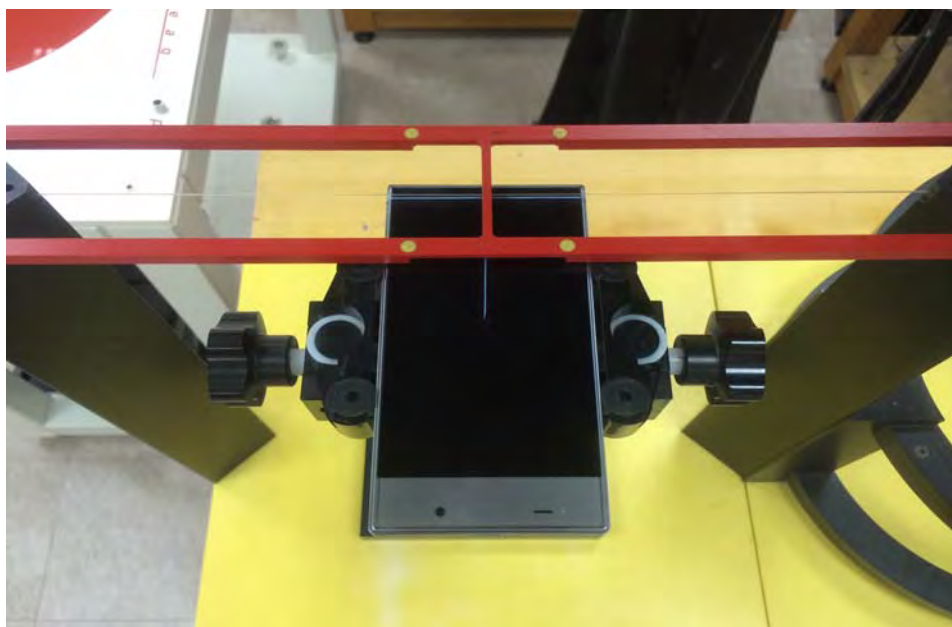
Fig. 2 Receiver of mobile contact center of Arch

Unless otherwise stated the results shown in this test report refer only to the sample(s) tested and such sample(s) are retained for 90 days only.