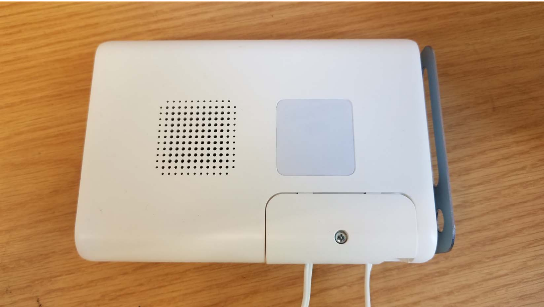
Top View of the EUT