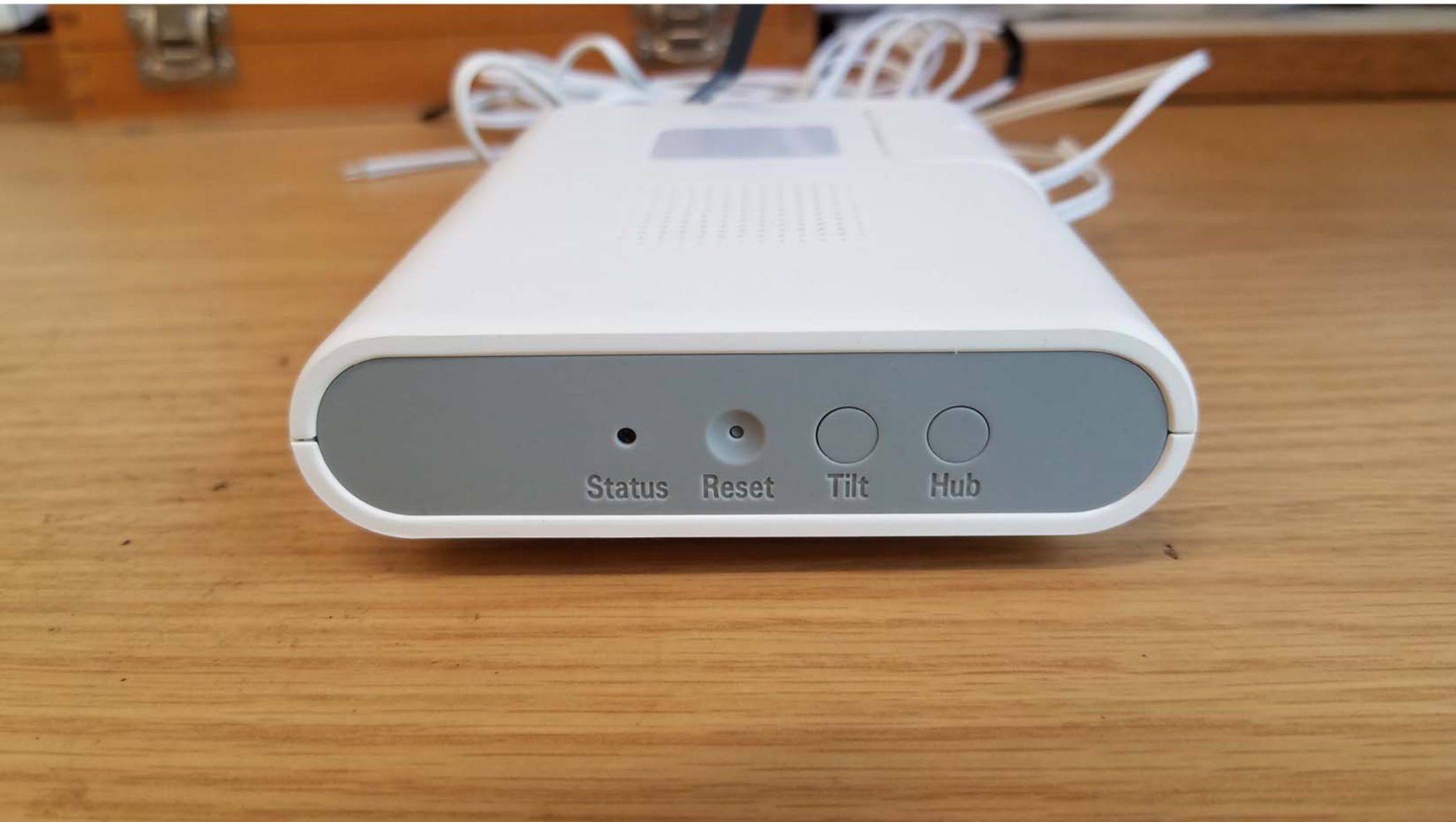
Side View #3 of the EUT