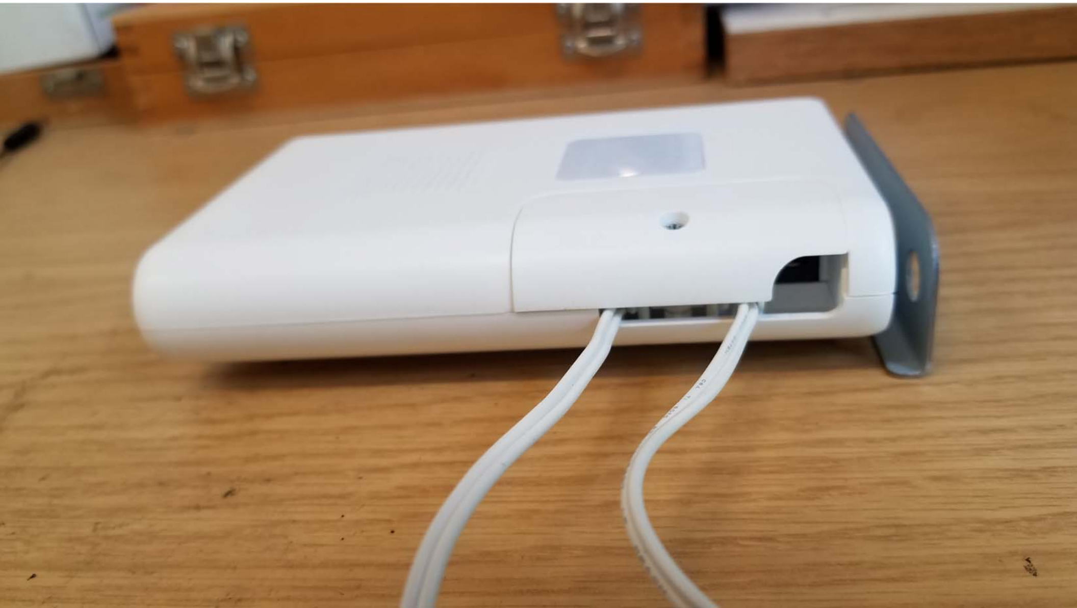
Side View #1 of the EUT