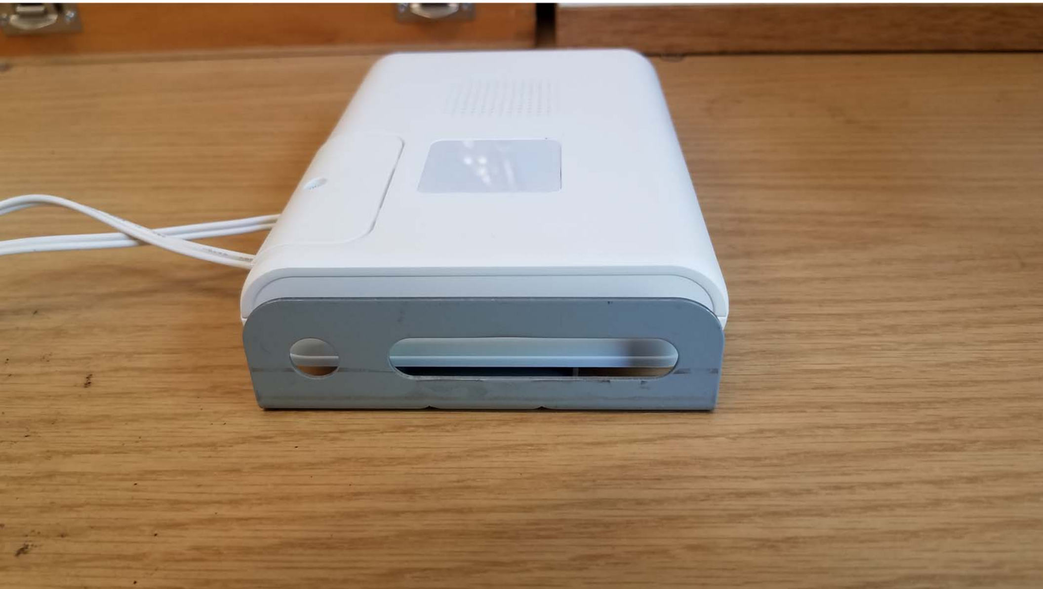
Side View #4 of the EUT