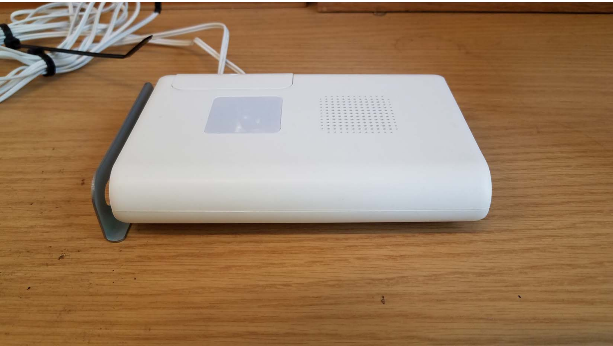
Side View #2 of the EUT