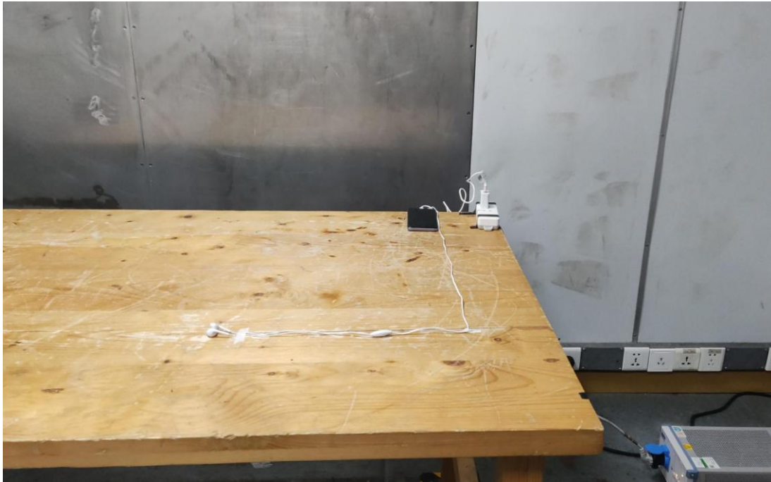
Photo of Conducted Emission Measurement