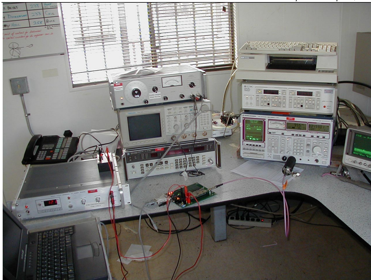
Setup Photo# 2