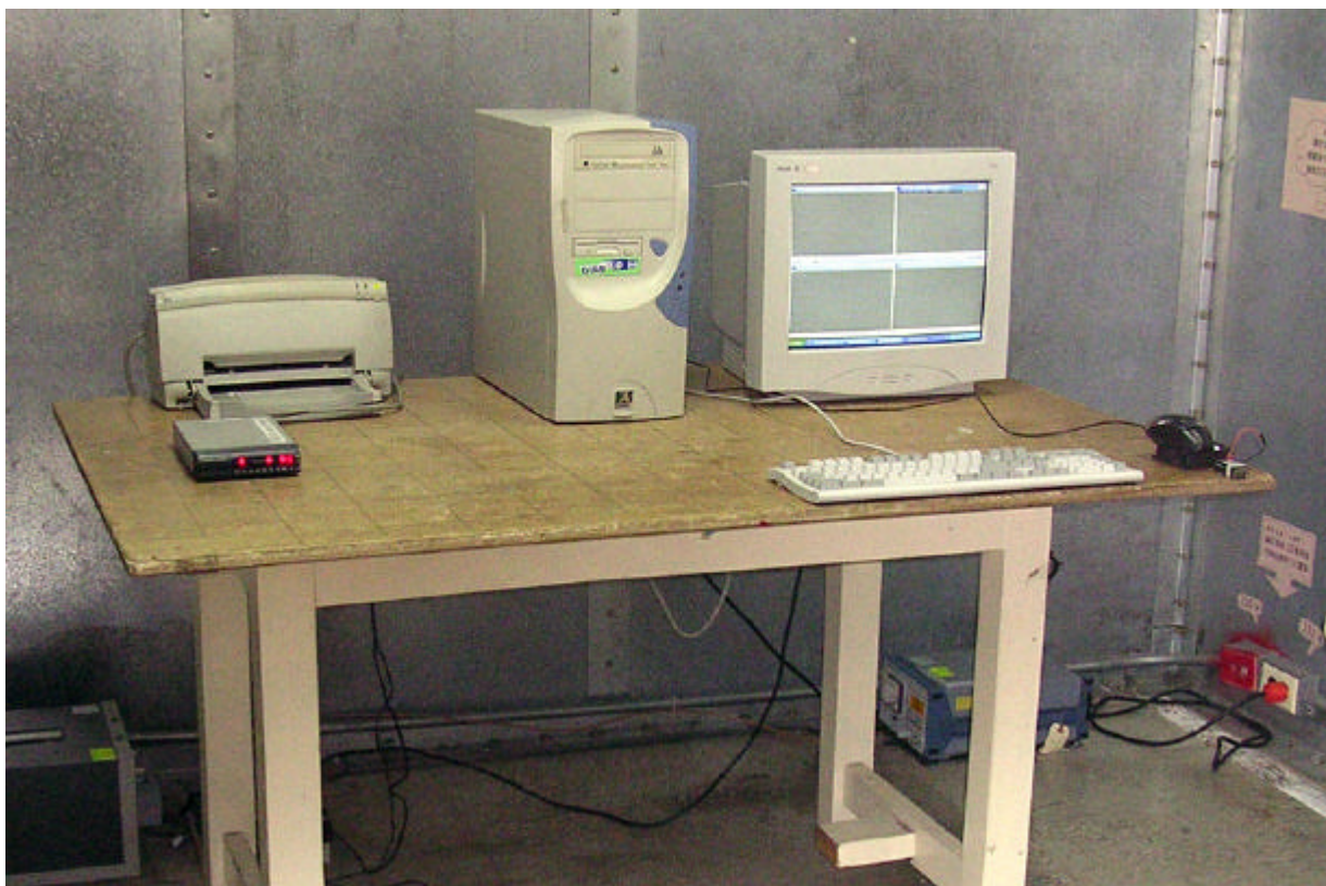
The Front View of Highest Conducted Set-up For EUT