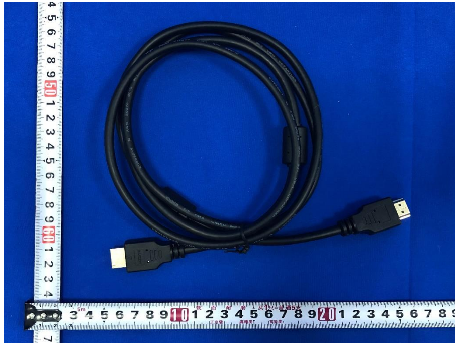
Photo 18 Optional accessories