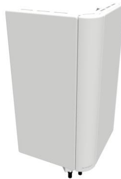
AEWE (extension module)