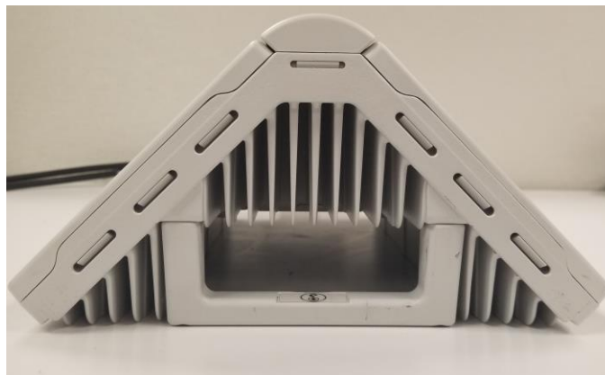
AEWE (extension module)