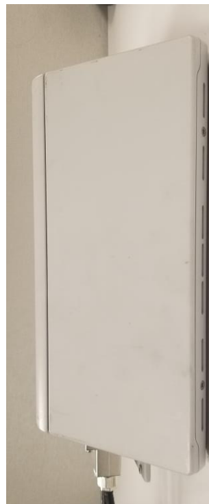
AEWE (extension module)