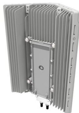
AEWE (extension module)