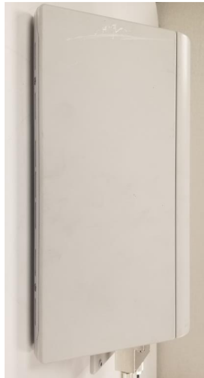
AEWE (extension module)