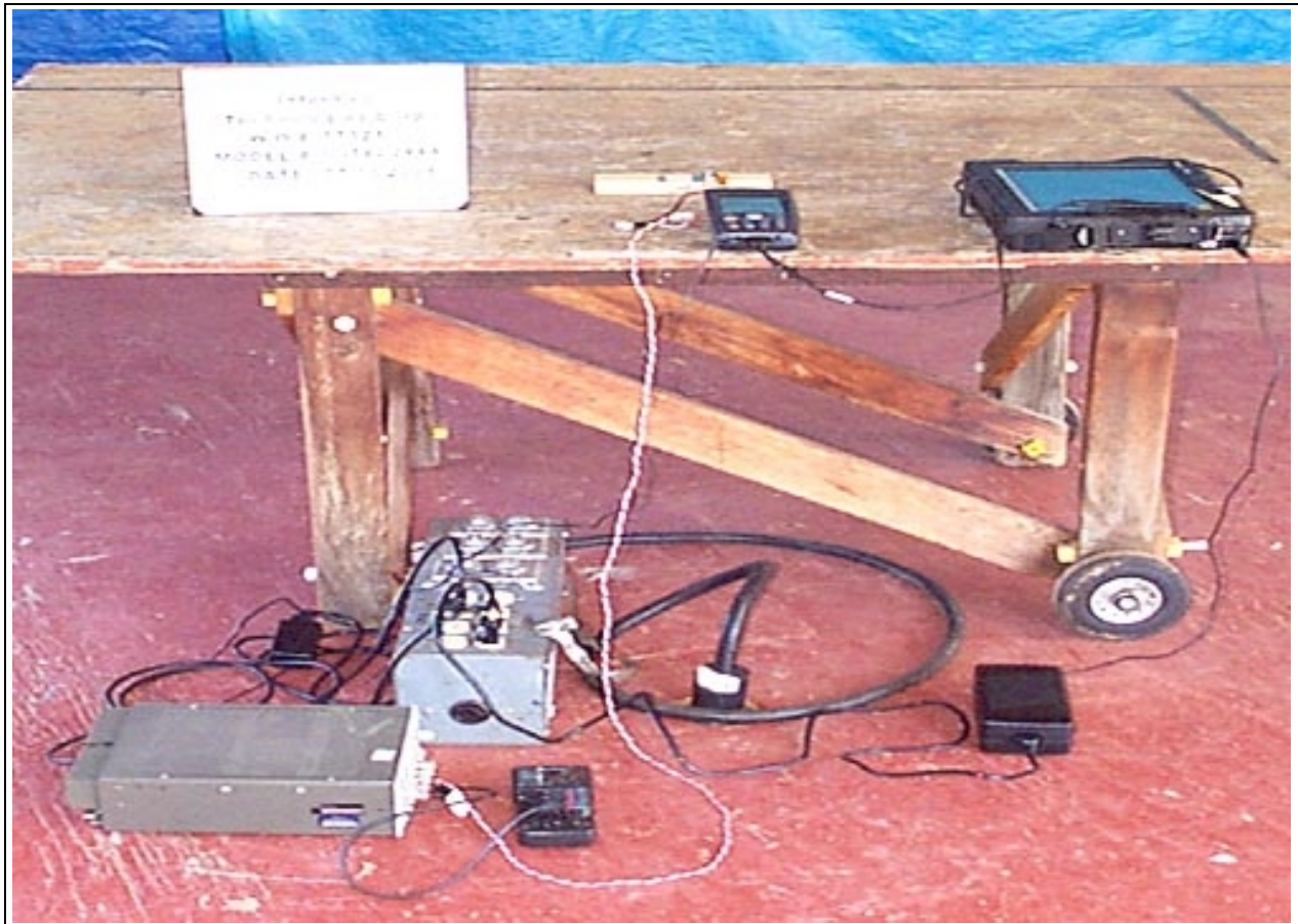
Radiated Emissions - Orthogonal A Back View