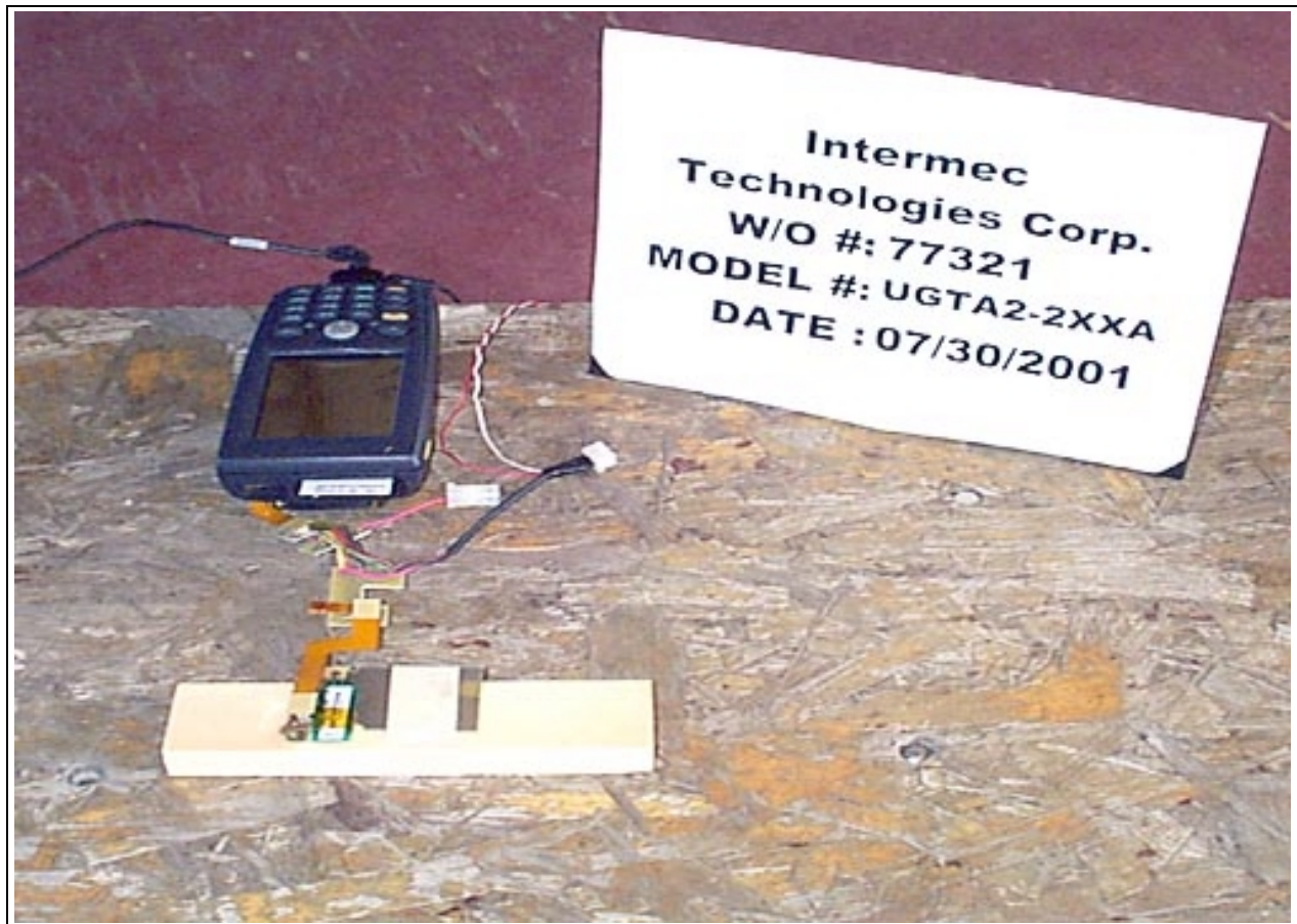
Radiated Emissions - Orthogonal A Close-up