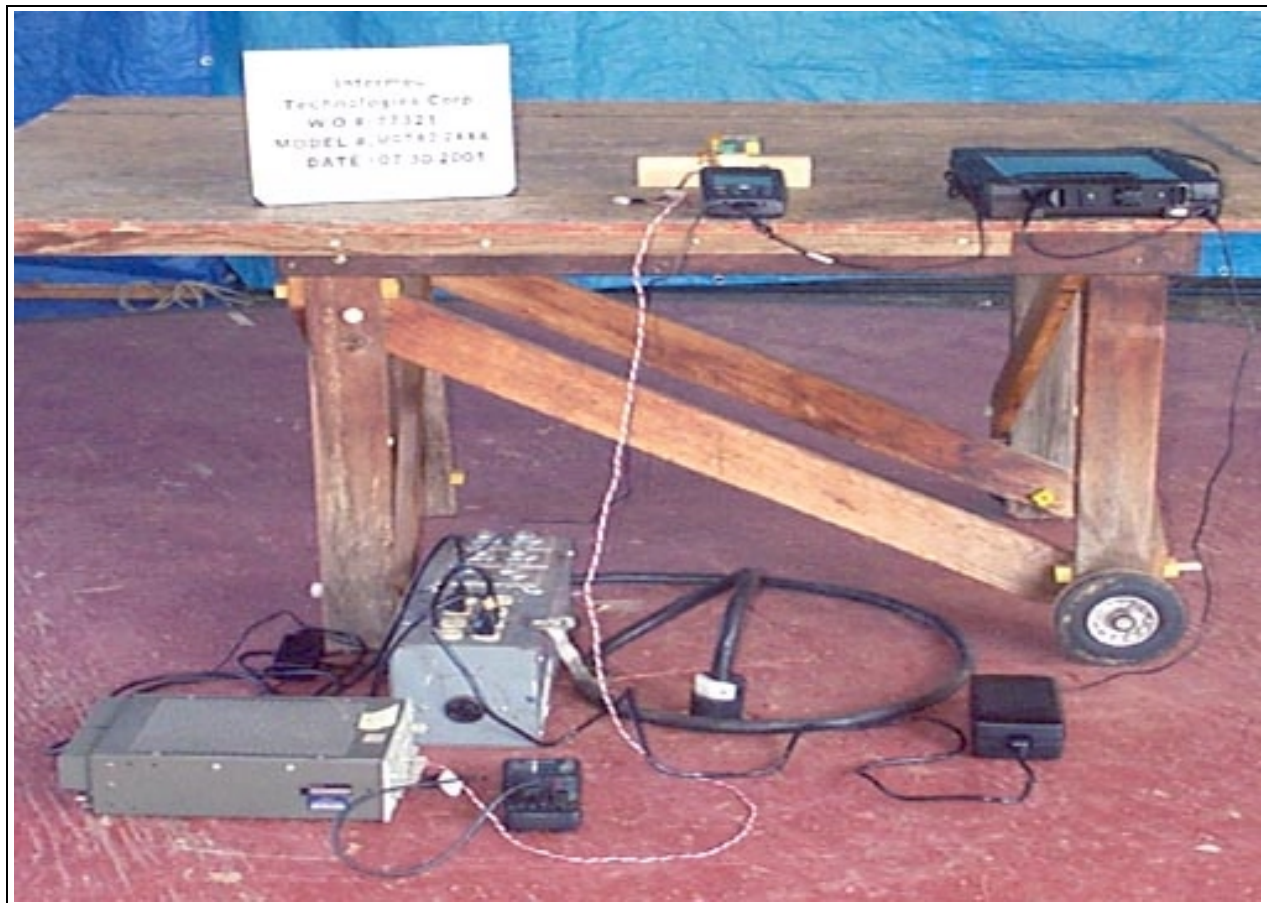
Radiated Emissions - Orthogonal B Back View