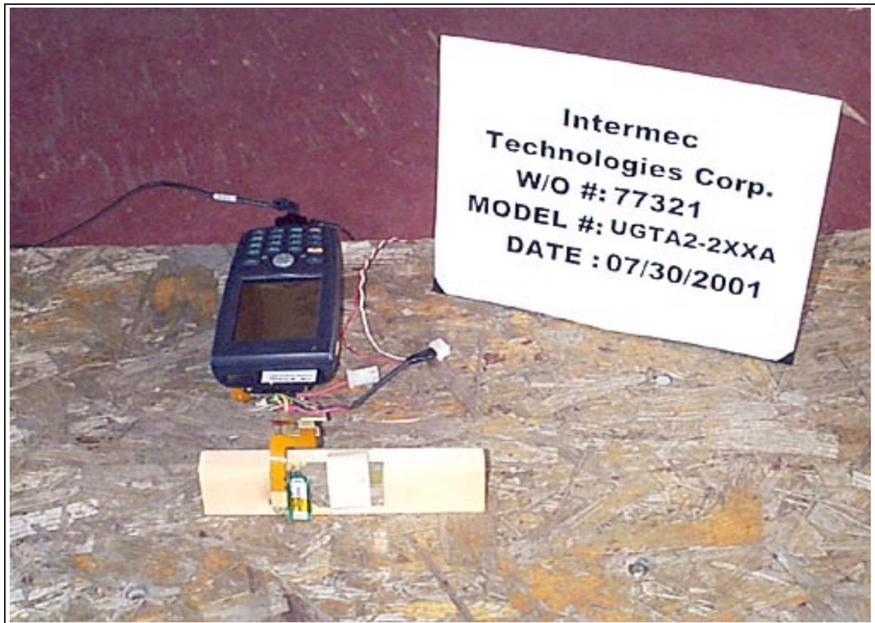
Radiated Emissions - Orthogonal B Front View Close-up