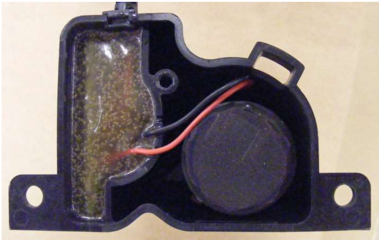
Figure 1: RFW-201 Internal View. Potted