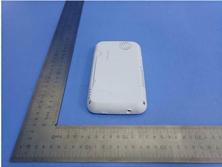
Photo 8 Appearance of EUT