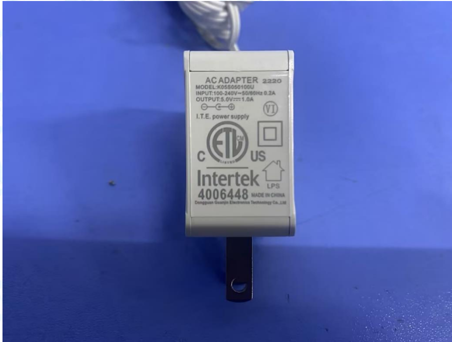
Photo 4 Appearance of Adapter