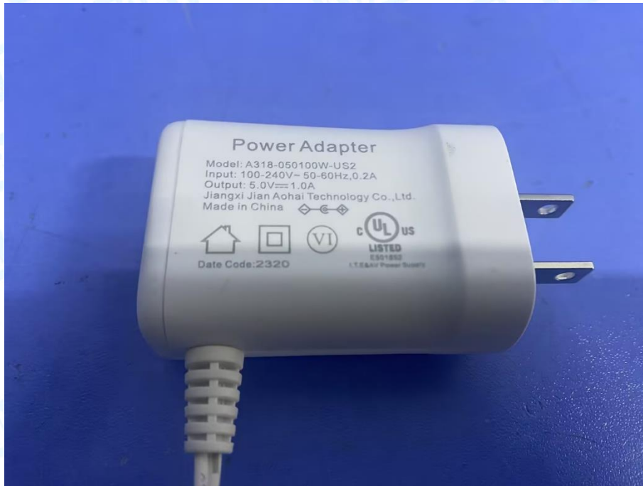
Photo 6 Appearance of EUT