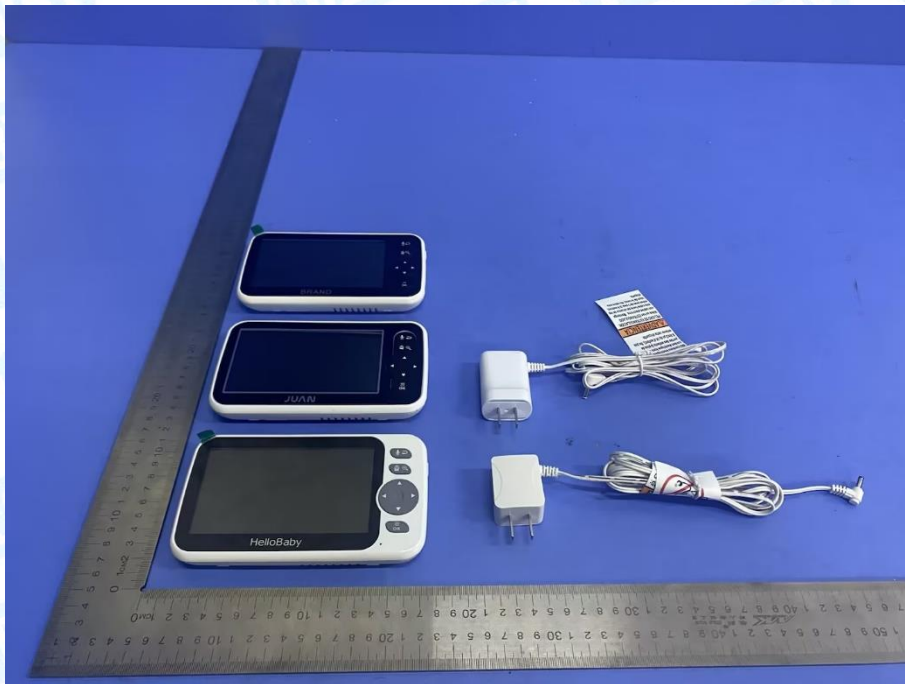
Photo 2 Appearance of Adapter