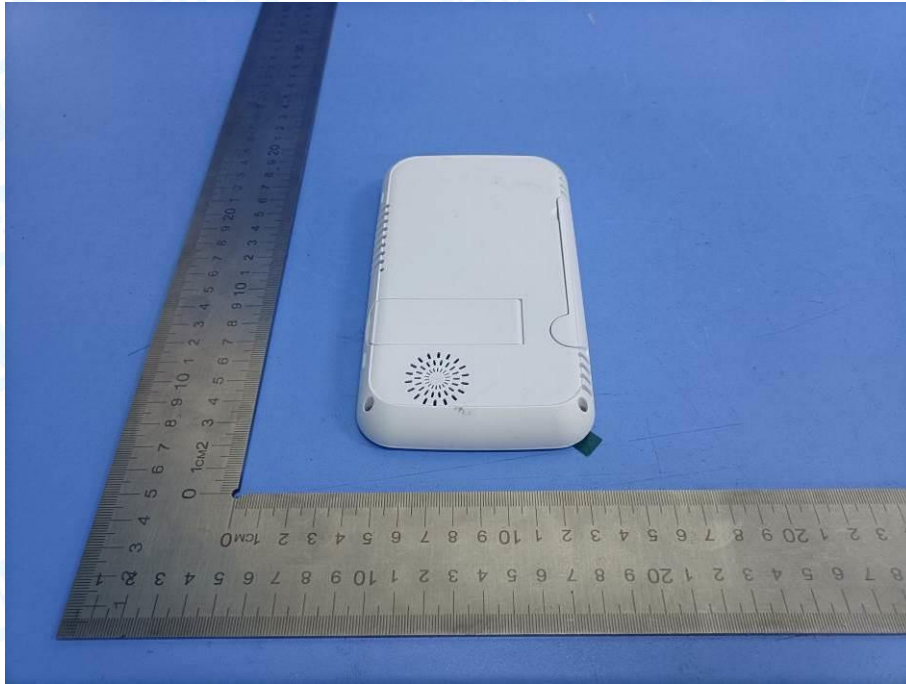
Photo 10 Appearance of EUT