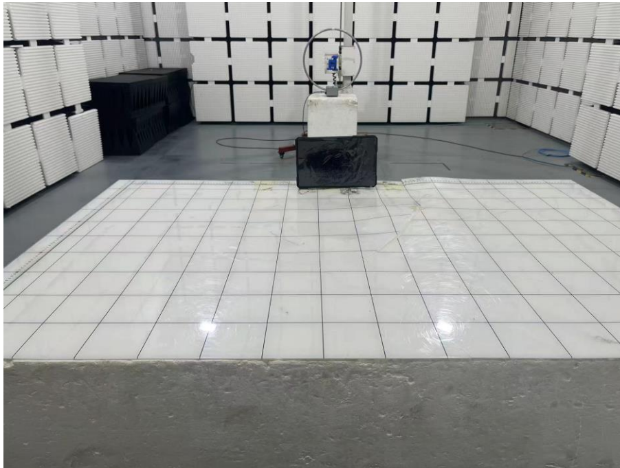
Set-up for Transmitter & Receiver Spurious Emissions, 30MHz to 1000MHz