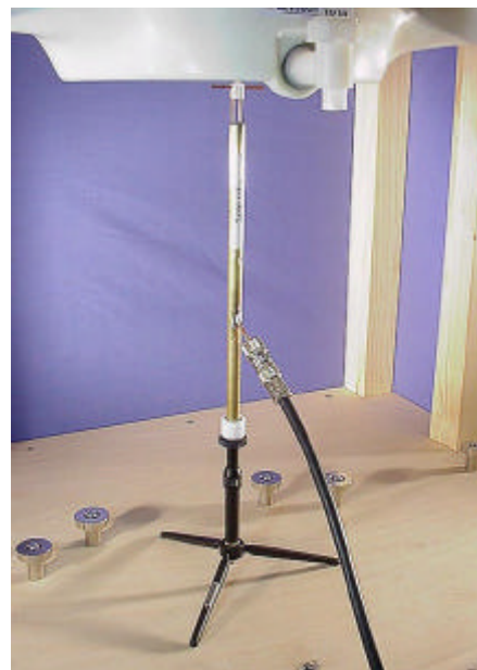
2450MHz System Check Setup Photograph