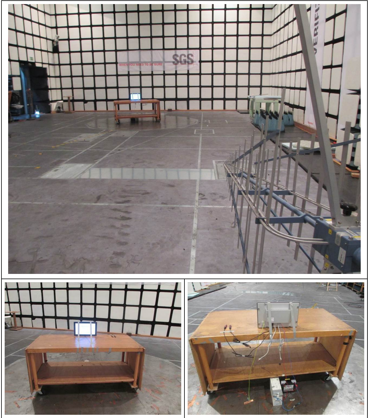
Figure 2: test setup Radiated disturbances 30 MHz to 1000 MHz