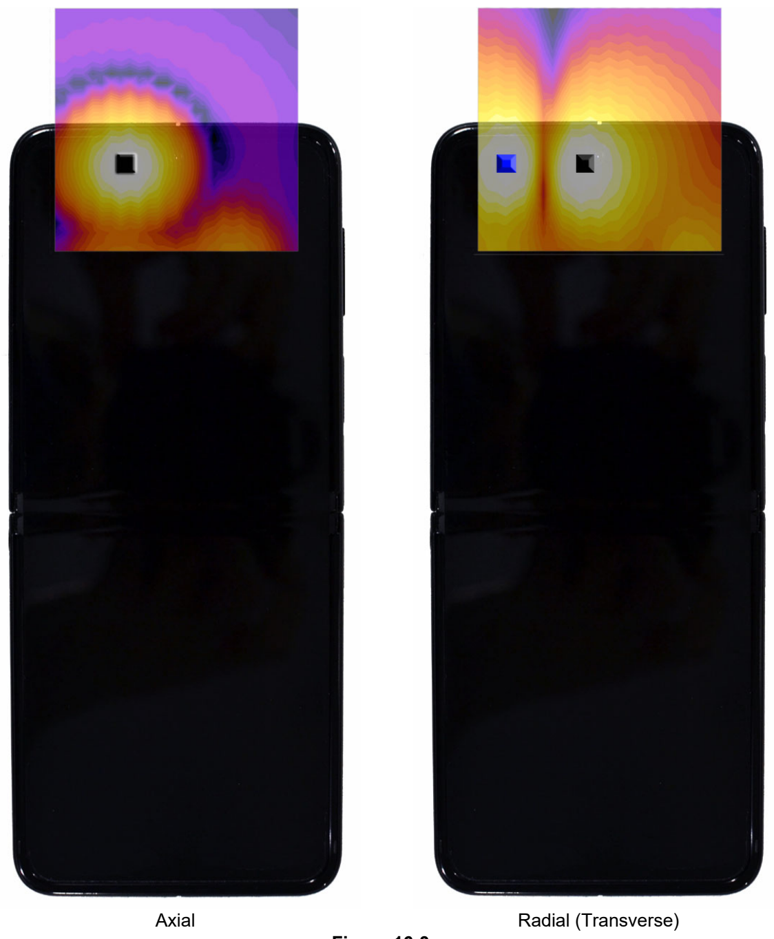
Figure 16-3 T-Coil Scan Overlay Magnetic Field Distributions

Note: Final measurement locations are indicated by a cursor on the contour plots. The GSM 850 radial measurement location is indicated by a blue cursor.