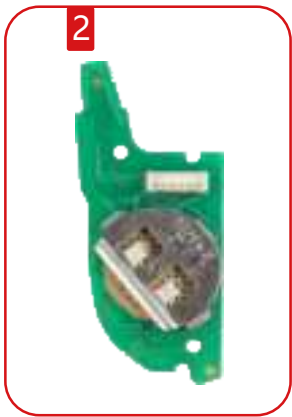
Take the battery out and replace new one

Note: The battery type is 2032 with 3V, ensure the positive and negative of battery is correct.