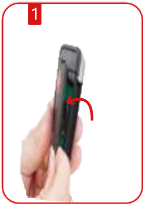
Break open the back side plastic cover to open the remote

First use or when the battery runs out need to change new battery, following steps: