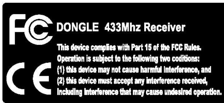
Sample Label of RF Dongle