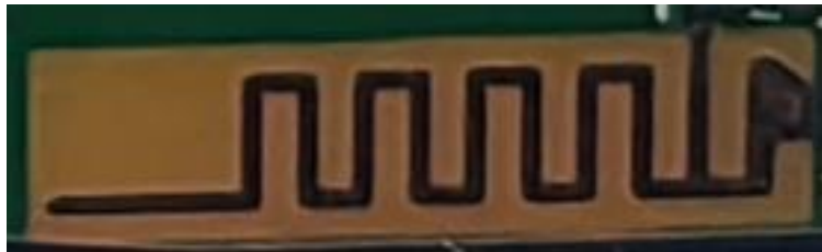
Length 10mm and width 2mm