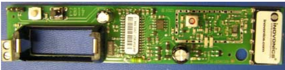
Photograph of the FA-250M board with the shield removed.