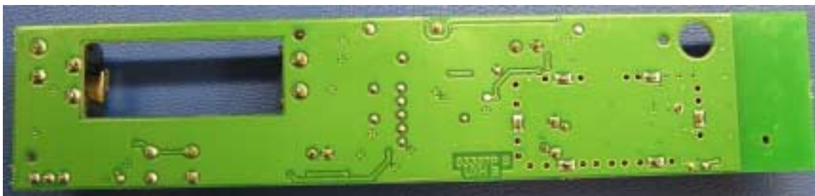
Photograph of the reverse side of the FA-250M board.