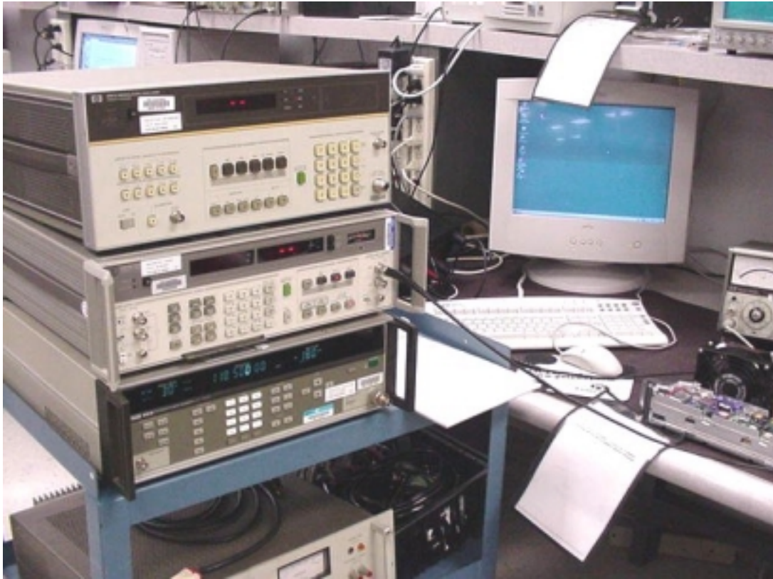
VHF Test Equipment, left side.