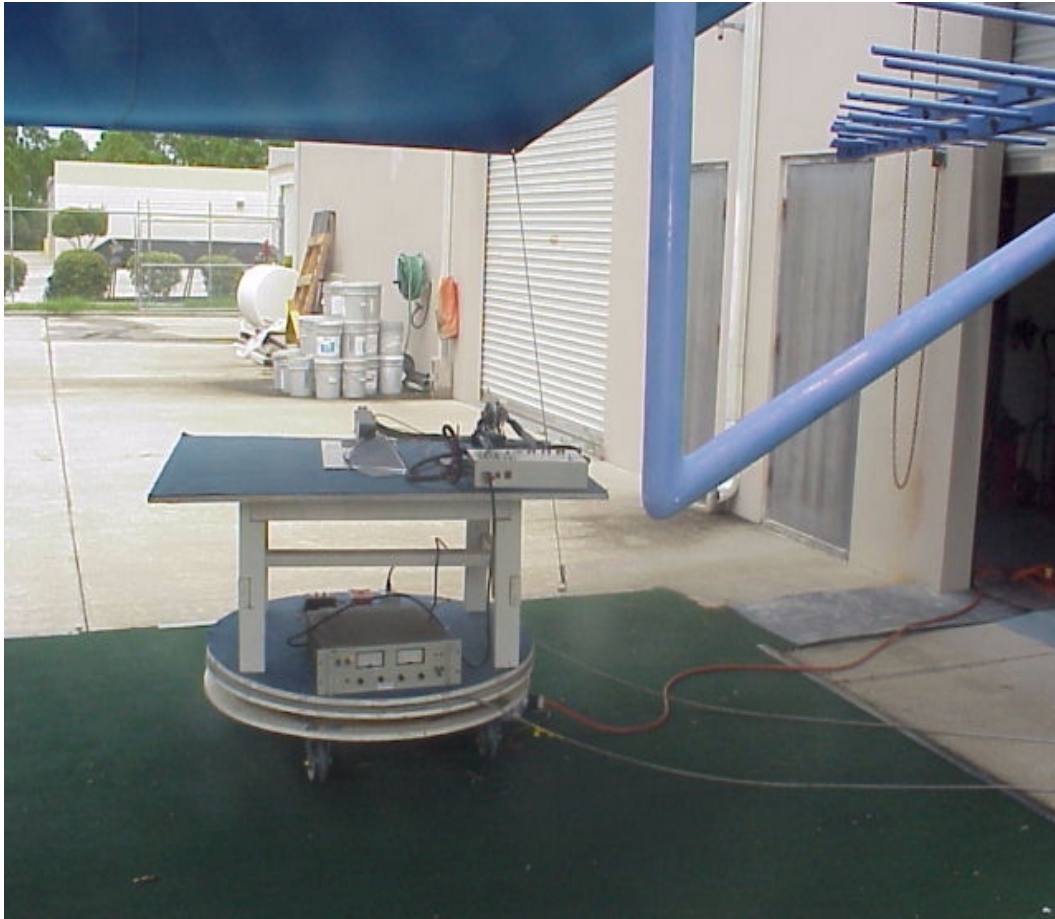
Test fixture at Rubicom (Testing Contractor) showing setup for radiated emissions testing.