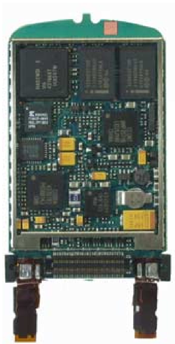
Exhibit 5: Bottom View of Printed Wire Board with screening can removed to show baseband circuitry.