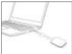
VS18188 Figure 1