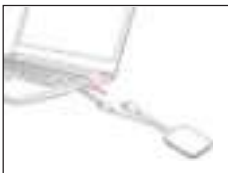
VS18189 Figure 2