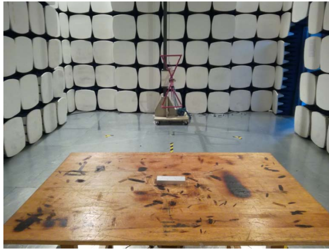
Radiated Emission (1GHz-25GHz)