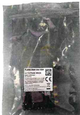
Atom UAV OEM in ESD bag with label