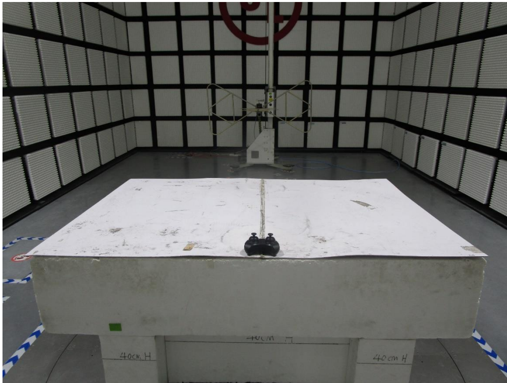
Radiated Disturbance below 30 MHz