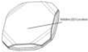
Figure 2: AP351 Front View

The following sections outline the hardware components of the AP351 Series access point.