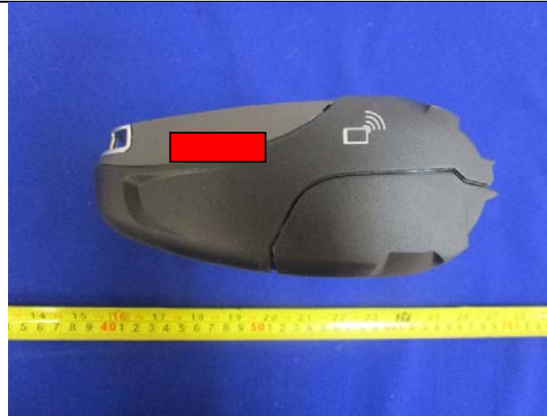
Test Position-2 (Left Side with 5mm distance)