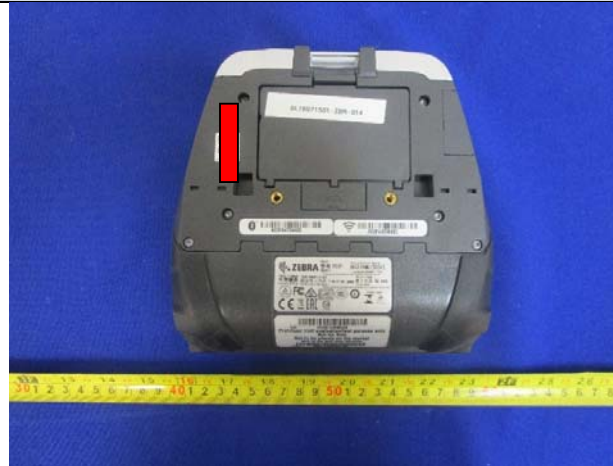
Test Position-1 (Bottom Side with 0mm distance)