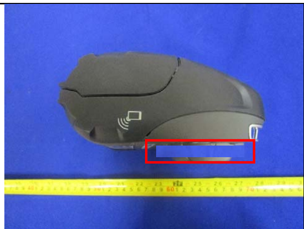
Extended battery installed

The extended battery has larger capacity. The printer is to be used with the bottom side against human body, the use of extended battery will increase the separation of printer bottom side to human body, thus decreasing the SAR value. The SAR testing in current report was performed with regular battery to represent the worst case.