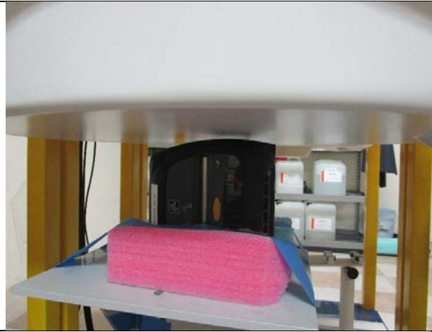
Left Side with 5mm distance from the phantom