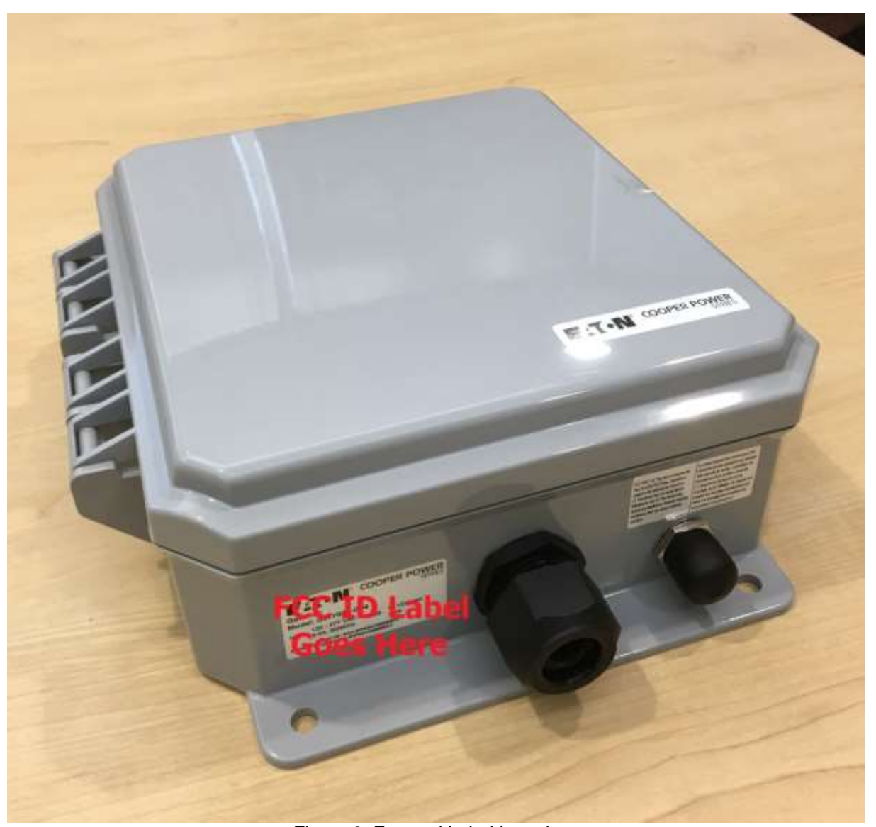
Figure 2: External Label Location