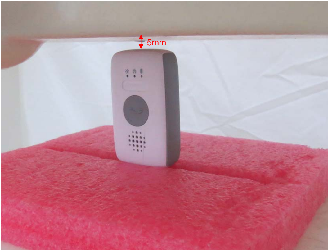
Picture 5: Bottom Side, the distance from handset to the bottom of the Phantom is 5mm