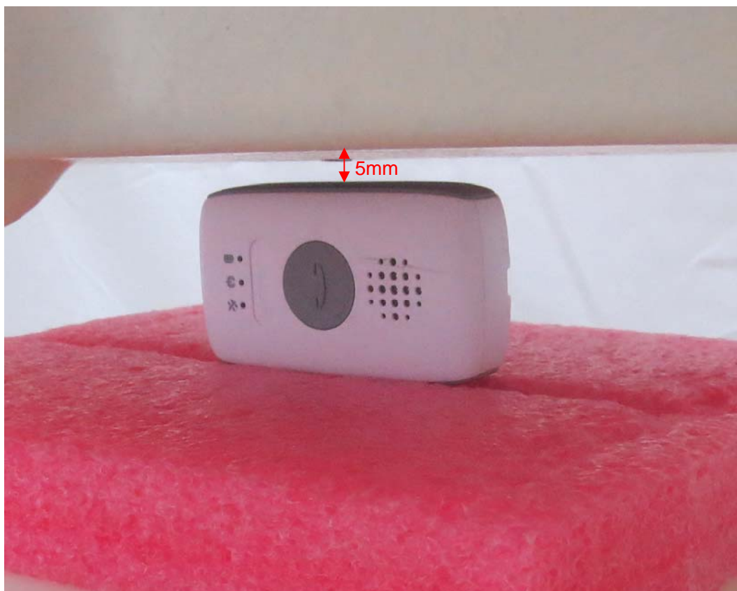
Picture 3: Left Side, the distance from handset to the bottom of the Phantom is 5mm