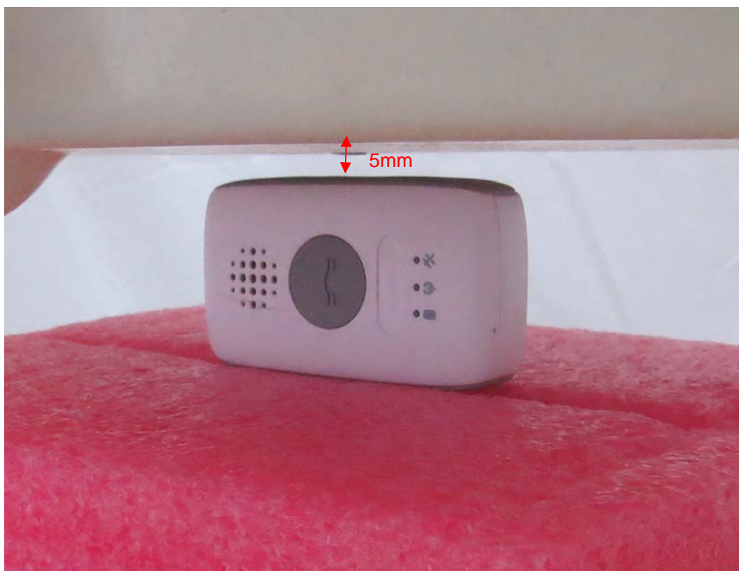
Picture 4: Right Side, the distance from handset to the bottom of the Phantom is 5mm