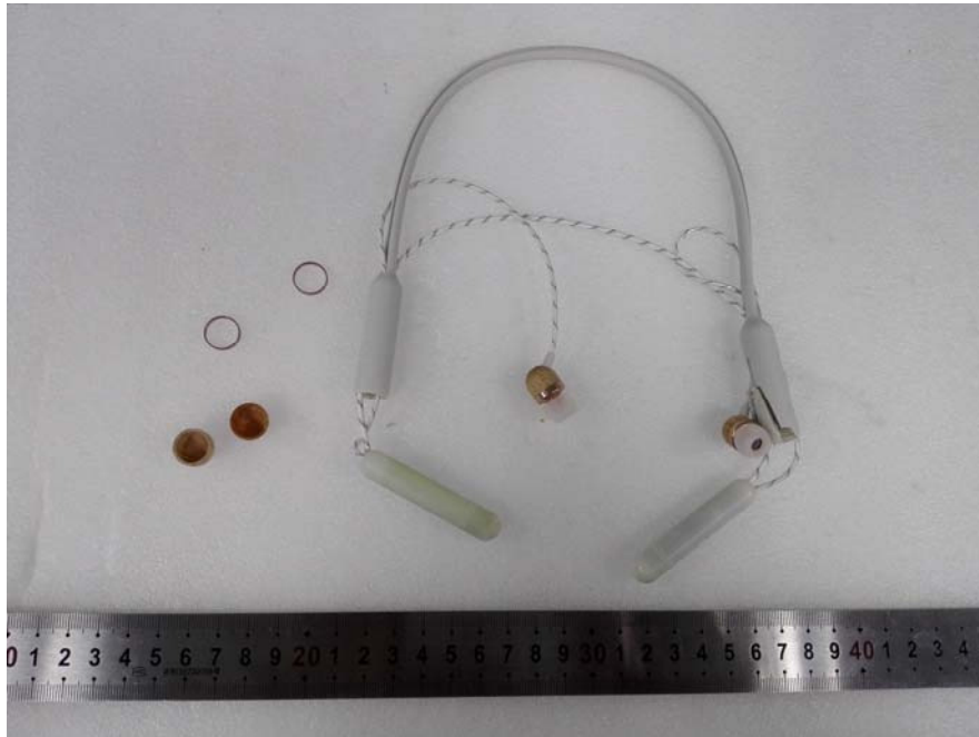
EUT – Cover off View 2