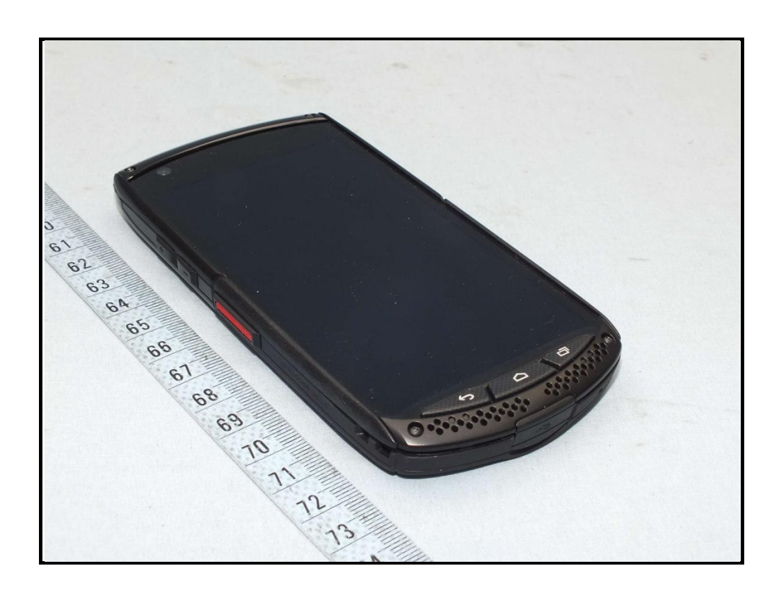
Page 1 of 3