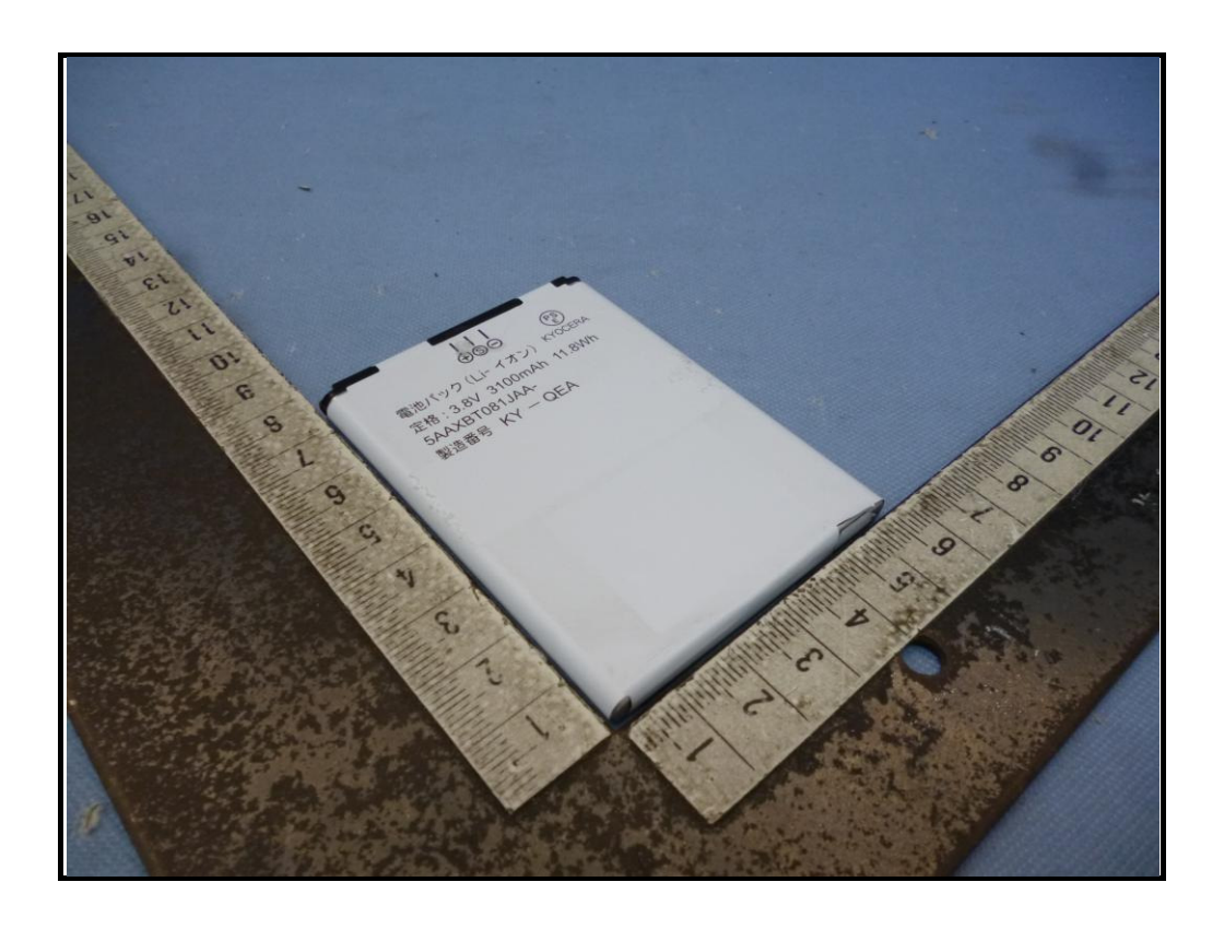
Page 2 of 3