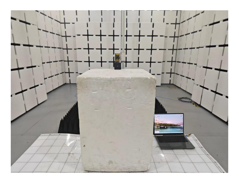
Set-up for Radiated Spurious Emission, Above 1GHz