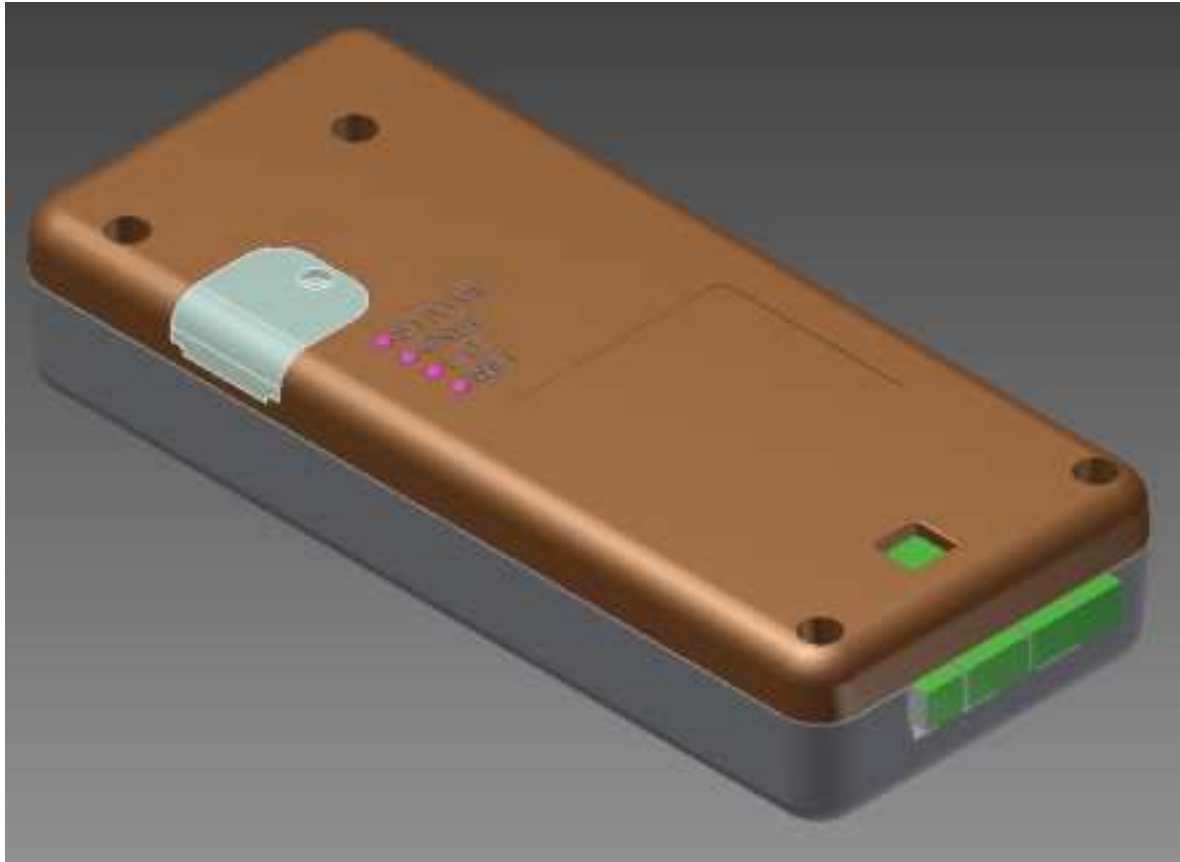
Figure 2 DC-20 Terminal

DC-20 is composed of the following components. It is required that separate harness cable assembly for the connection with the personal mobility.