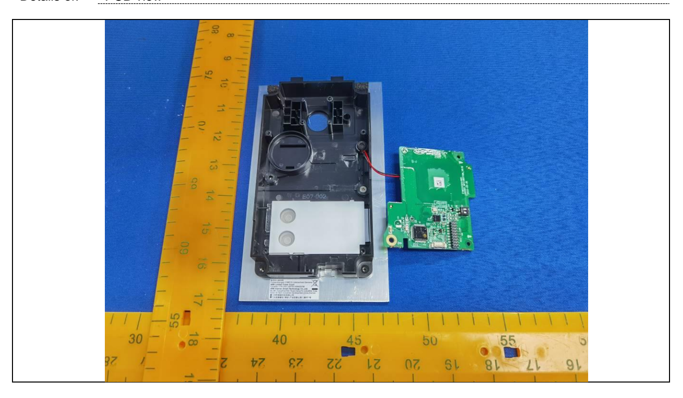
Details of: PCB view