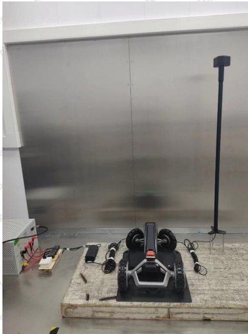
Photo of Radiation Spurious Emission Test