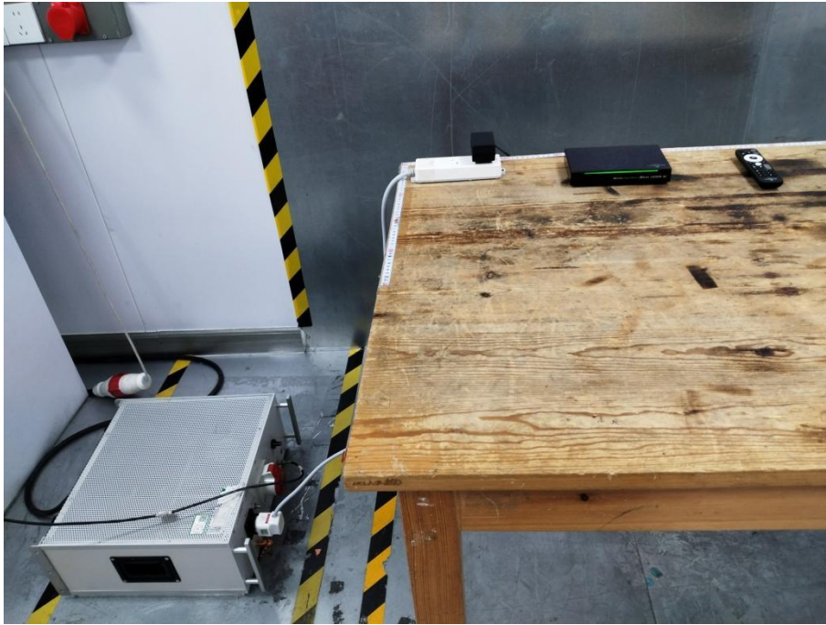
Emissions in frequency bands (below 1GHz)