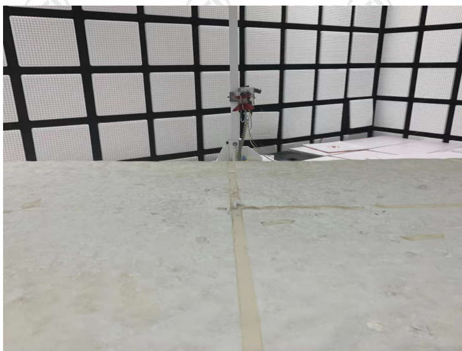
Radiated spurious emission Test Setup-2 left ear(Above 1GHz)