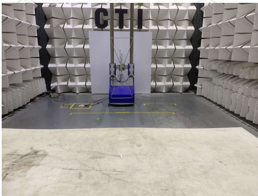
Radiated spurious emission Test Setup-1 left ear(Below 1GHz)