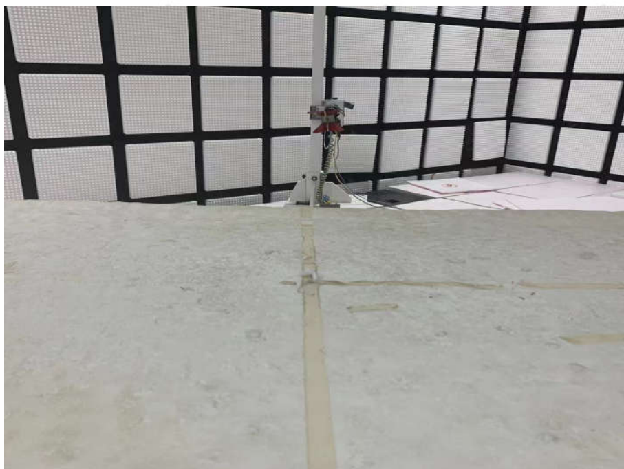
Radiated spurious emission Test Setup-2 right ear(Above 1GHz)