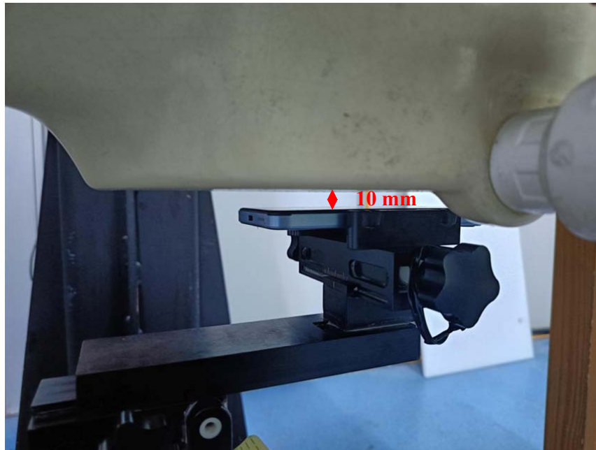
Body (Worn) Back Setup Photo (10mm)