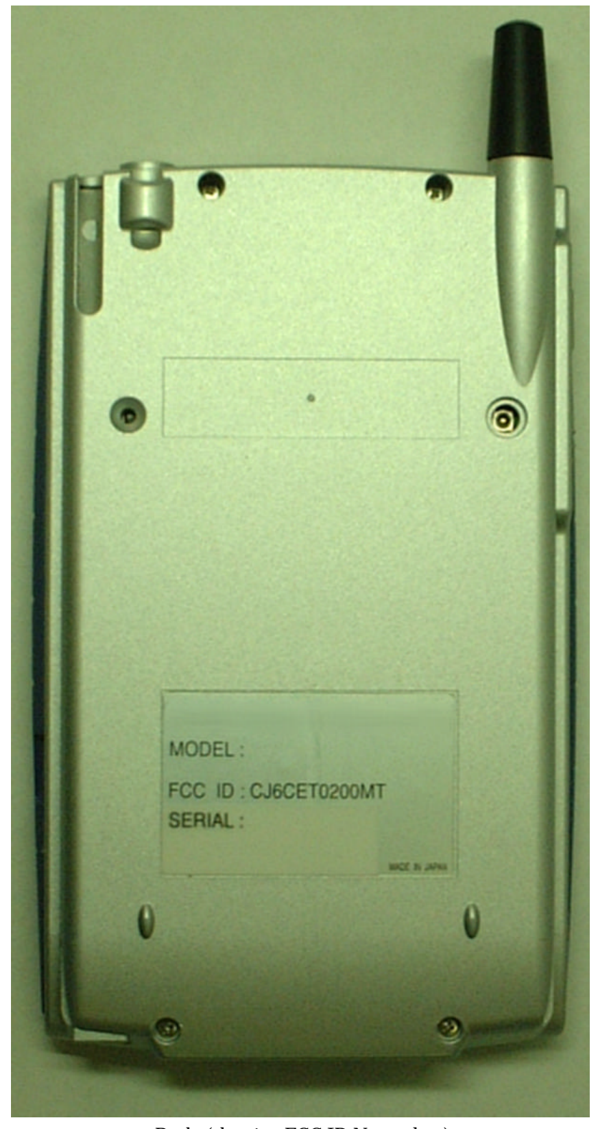
Back (showing FCC ID Nameplate)