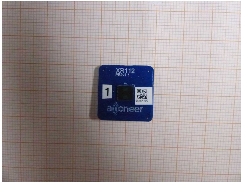
XR112 + A111 front view