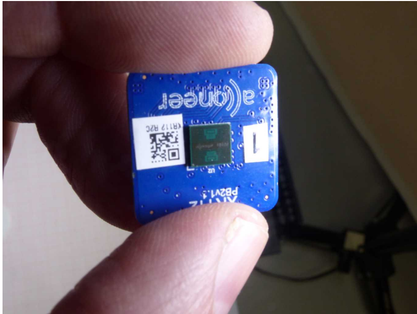
A111 close view