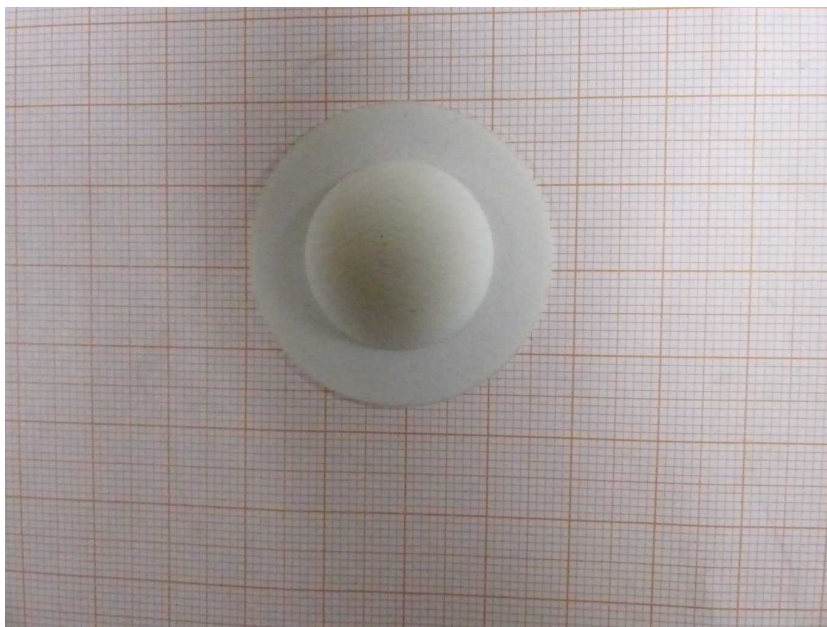
Lens LH112 front view