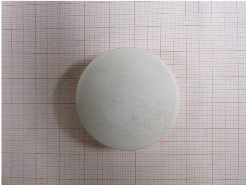
Lens LH112 rear view