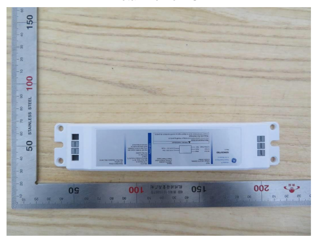
Detail View of EUT