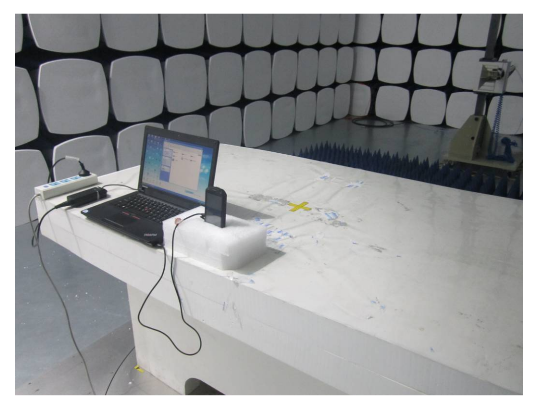
Radiated Spurious Emissions Test Setup Above 1GHz -Front View