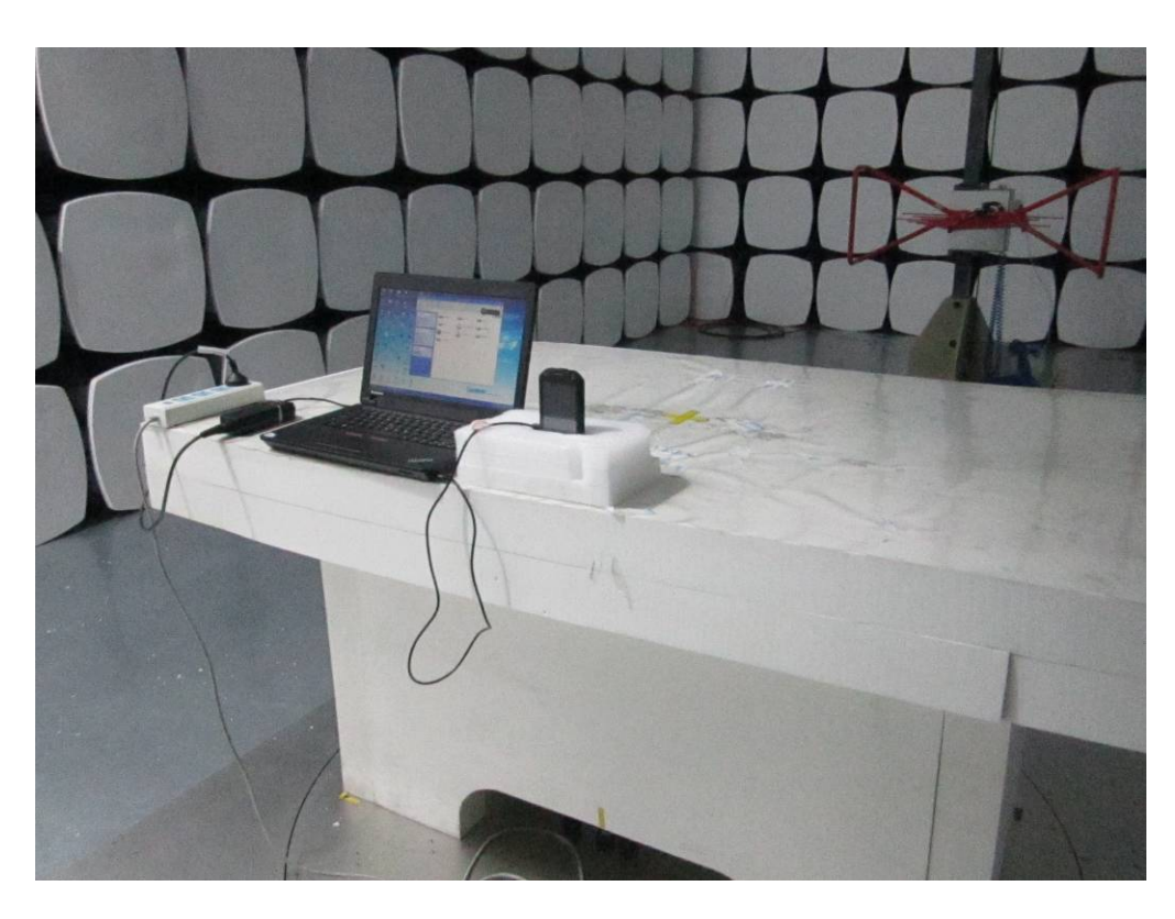
Radiated Spurious Emissions Test Setup Below 1GHz - Front View

Report No.: 14070321-FCC-E1 Issue Date: August 05, 2014 Page: 32 of 38 www.siemic.com