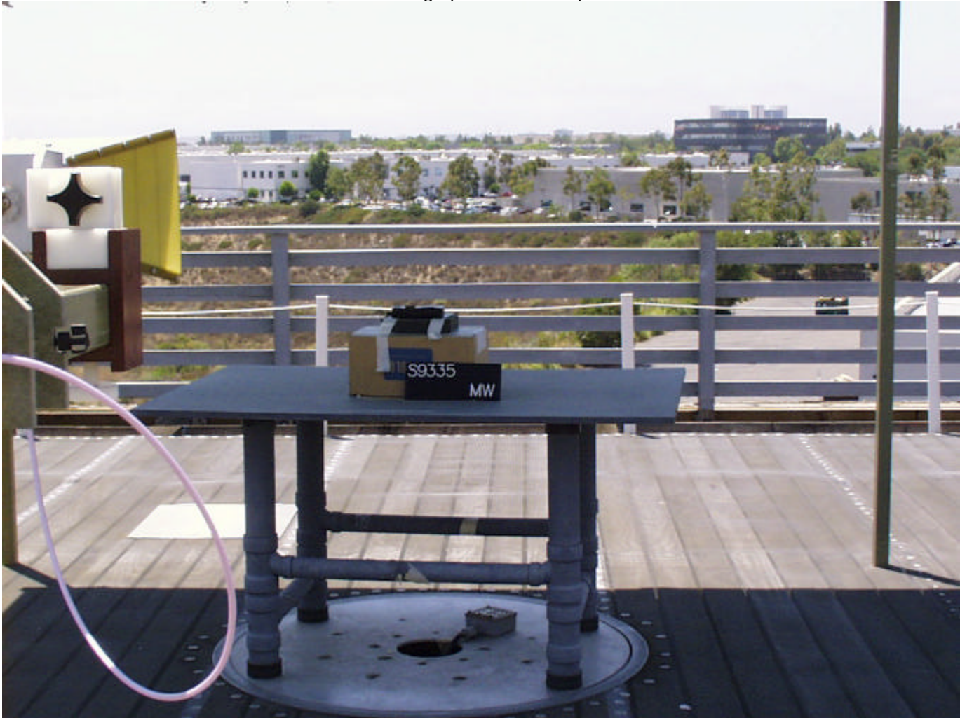
Photograph of Test Setup