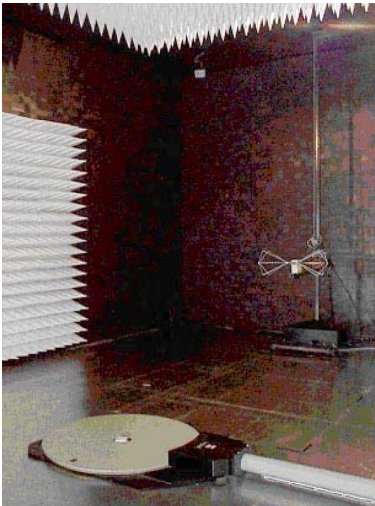
Figure 1 View from within chamber showing turntable base and mast set-up.