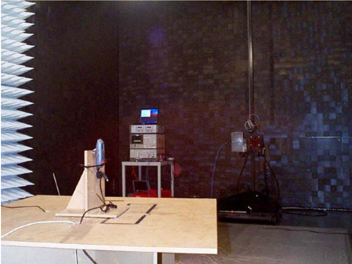
Figure 3 Set up in chamber for 2GHz-7GHz measurements at 3m.