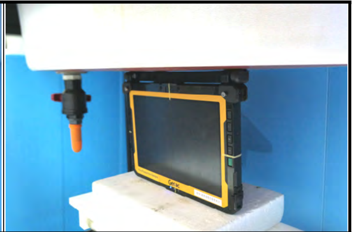
Top Side with Handle of Tablet Mode Tested at 0 mm