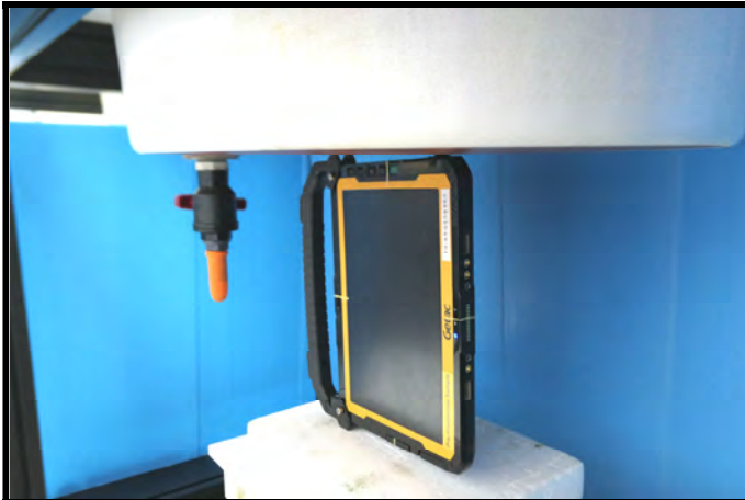
Right Side with Handle of Tablet Mode Tested at 0 mm