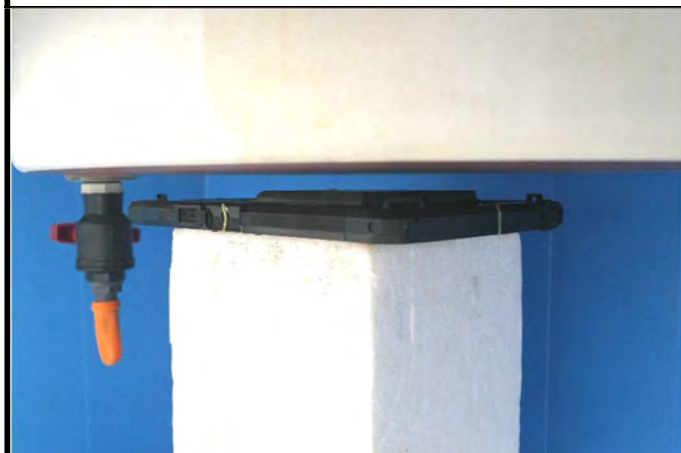
Rear Face of Tablet Mode Tested at 12 mm