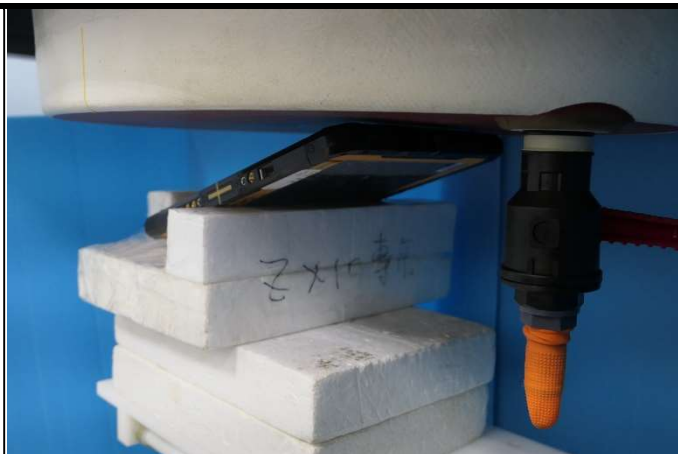
Right Curve 1 of Tablet Mode Tested at 0 mm