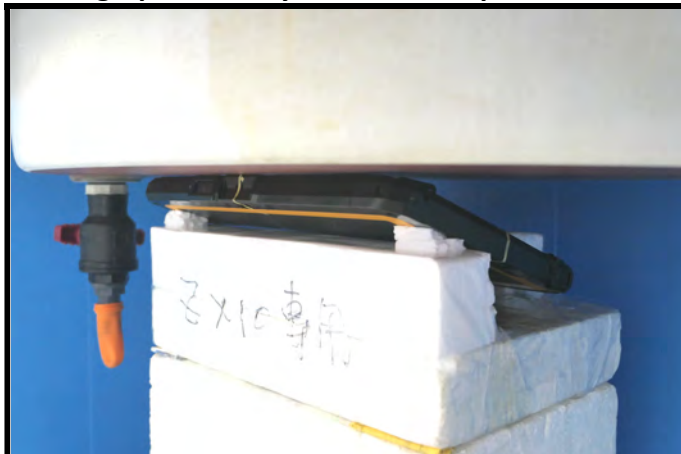
Rear Curve 0 of Tablet Mode Tested at 0 mm