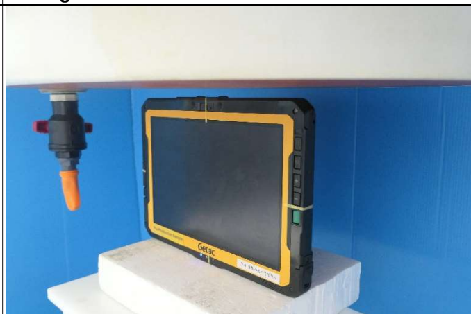
Top Side of Tablet Mode Tested at 10 mm