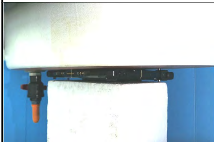
Front Face with Handle of Tablet Mode Tested at 0 mm